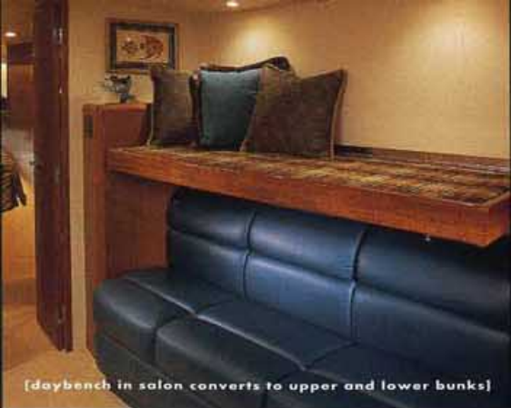
[daybench in salon converts to upper and lower bunks]