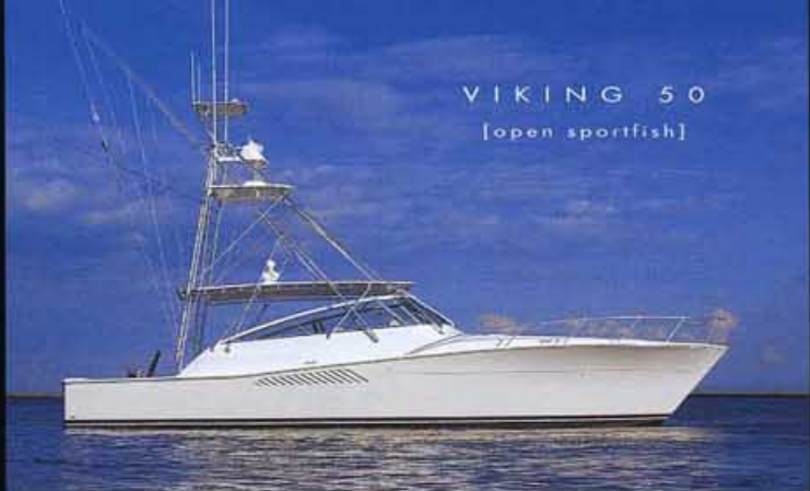
VIKING 50 [open sportfish]