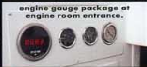
engine gauge package at engine room entrance.

"Everything in the engine room is laid out to provide maximum accessibility."